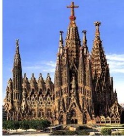
01 night Barcelona