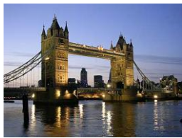
01 night London