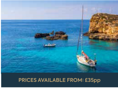
PRICES AVAILABLE FROM: £35pp