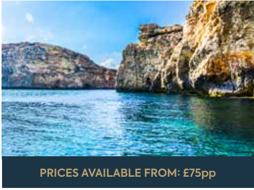
PRICES AVAILABLE FROM: £75pp

Night time brings out a different character in some places, and this tour aims to capture the beauty of Malta by night. Beginning with a visit to Vittoriosa, you will be able to appreciate the Grand Harbour and its magical lighting, followed by a walk around the city's streets and waterfront led by your guide. You will then be driven to Valletta and will walk through Malta's capital city's quaint and beautifully lit streets.