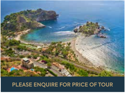
PLEASE ENQUIRE FOR PRICE OF TOUR

This excursion will allow you to appreciate the differences between Malta and Gozo. Arrive at Mgarr harbour in Gozo after a 20 minute ferry ride. From here, your guide will escort you to the temples of Ggantija, which predate the Great Pyramids of Egypt. You will then visit the medieval citadel in Victoria and Dwejra bay from where you will marvel at the sunset before enjoying dinner in a local restaurant.