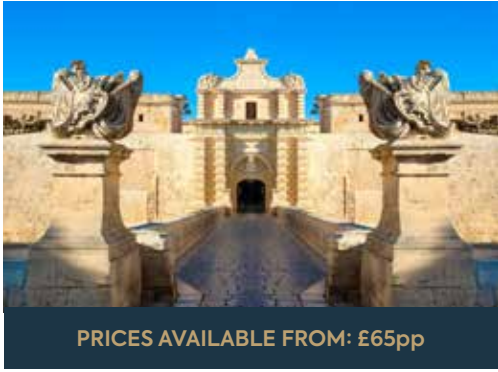
PRICES AVAILABLE FROM: £65pp

Marsaxlokk is a quaint and traditional fishing village in the south-east of Malta with a unique character and the iconic, colourful luzzus (fishing boats). You will get to enjoy the Sunday morning market, mixing with the locals and browsing the unique offerings. Continue on to the Blue Grotto and nearby caves enjoying the views of the Mediterranean and the islet of Filfla. Your guide will then help you discover a beautiful unspoilt village.