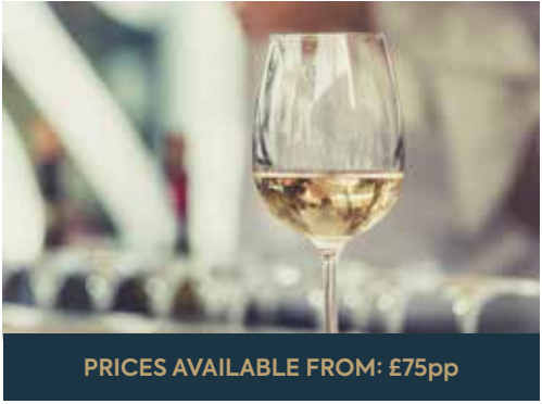
PRICES AVAILABLE FROM: £75pp

Being in the centre of Malta, the island's old capital city Mdina is often overlooked by tourists, but it is certainly worth some attention. With this excursion you will walk through the medieval winding streets and appreciate the Baroque architecture and Siculo-Norman palaces. Leave Mdina through the 'Greek Gates' en-route to the cliffs at Dingli. You will also visit the San Anton botanical gardens, the crafts centre at Ta'Qali and the magnificent Mosta's Dome.