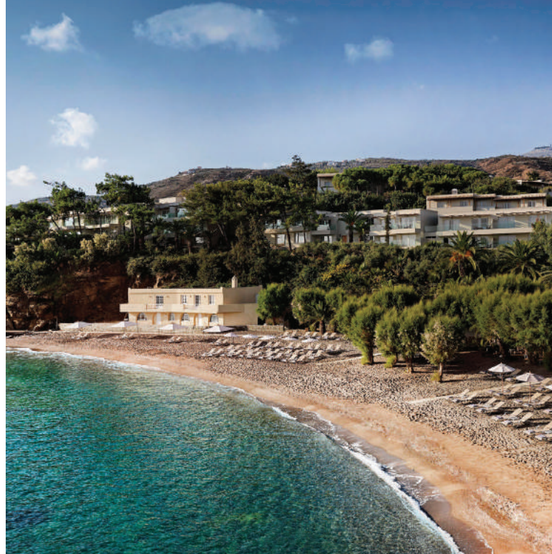
Wedding/Blessing Types: Civil, Beachside