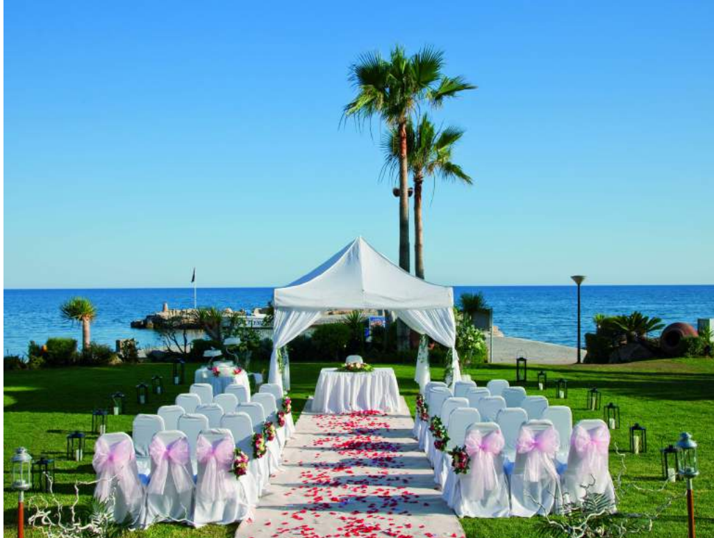
Wedding/Blessing Types: Civil, Beachside