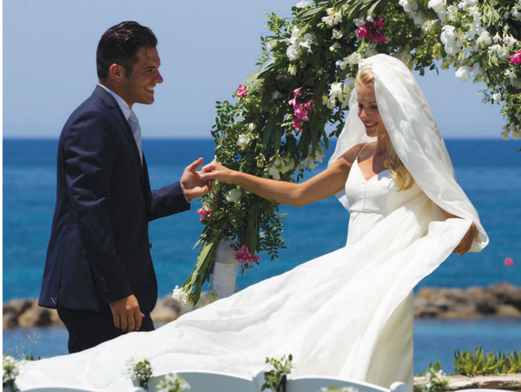
Wedding/Blessing Types: Civil, Beachside