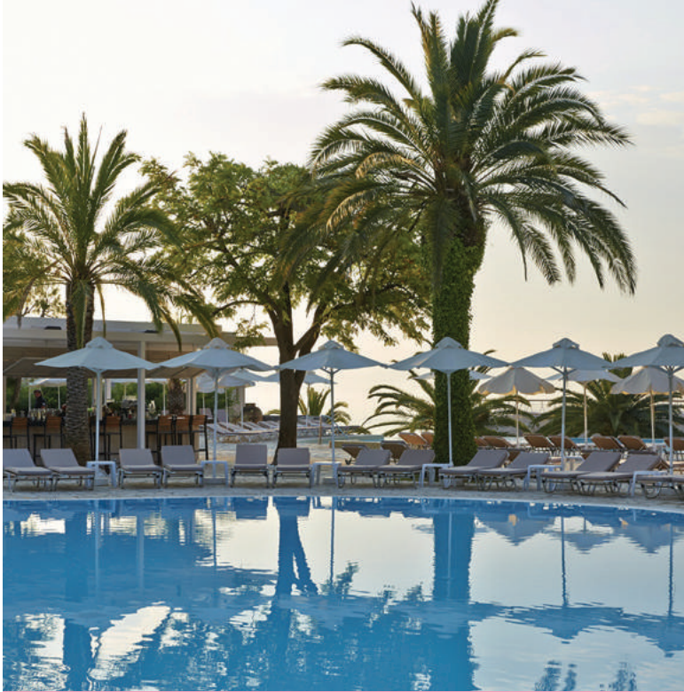
Wedding/Blessing Types: Civil