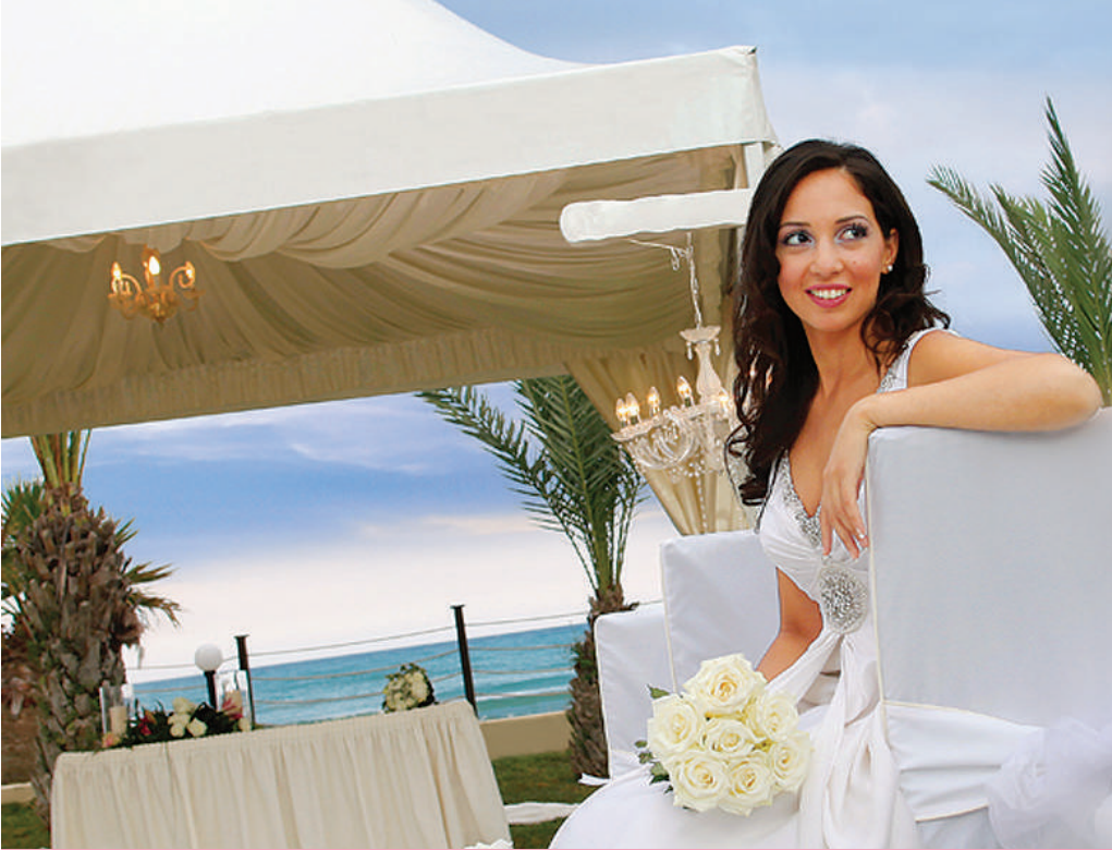
Wedding/Blessing Types: Civil, Beachside