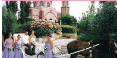
St George's Church - Paphos

This stunning chapel is the ideal place to get married if the idea of an intimate wedding interests you. Holding 30 guests comfortably making it even more private and special, the architectural touches give it an authentic feel, setting the perfect scene on your special day.