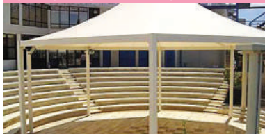
Ayia Napa Amphitheatre - Ayia Napa

The perfect outdoor venue for your civil ceremony is the impressive amphitheatre. The amphitheatre has unlimited space for guests, allowing you to share your special moment with as many people as you wish.