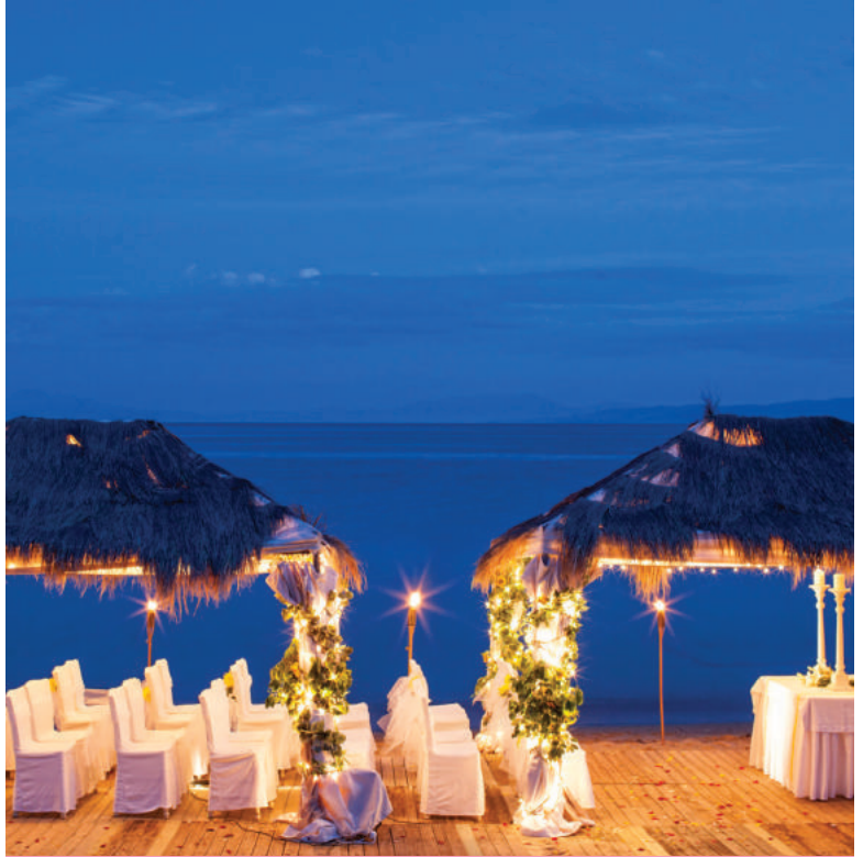
Wedding/Blessing Types: Civil, Beachside