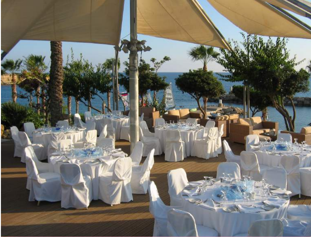
Wedding/Blessing Types: Civil, Beachside