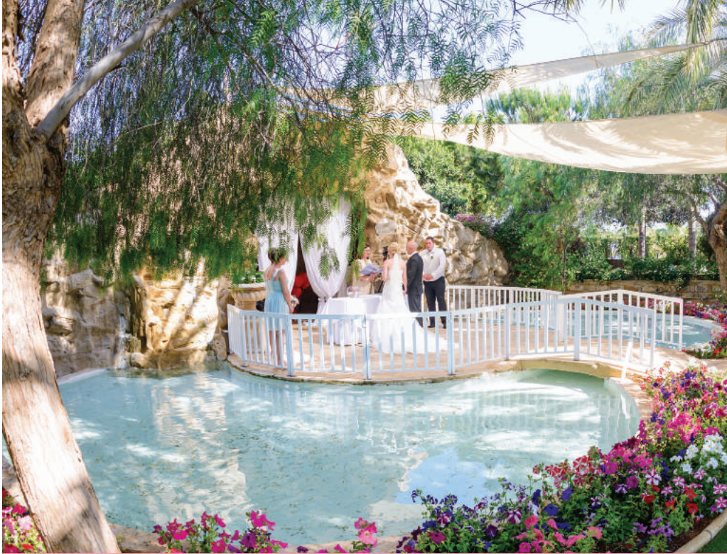
Wedding/Blessing Types: Civil, Beachside