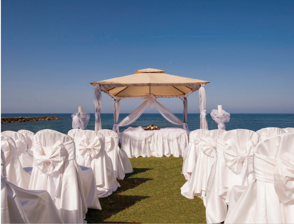
Wedding/Blessing Types: Civil, Beachside