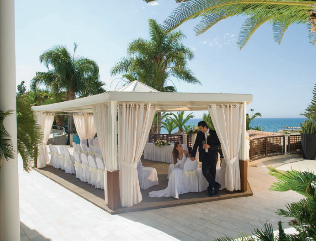
Wedding/Blessing Types: Civil, Beachside