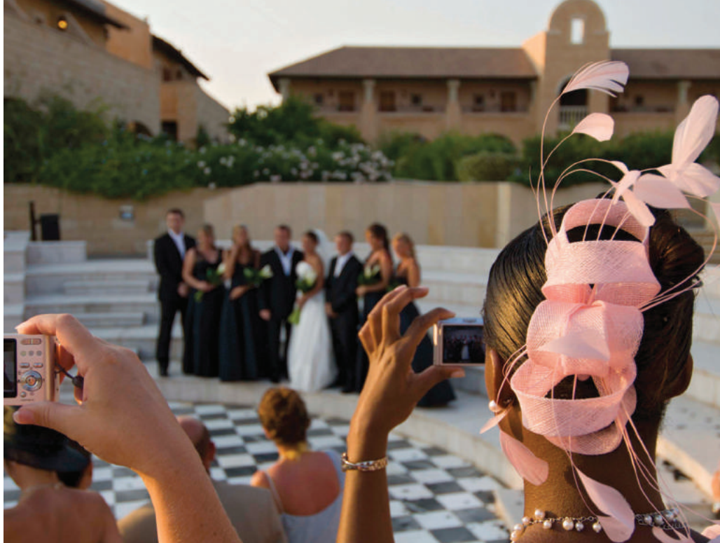
Wedding/Blessing Types: Civil, Beachside, Anglican, Catholic