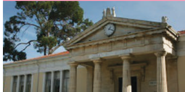
Paphos Town Hall - Paphos

Paphos town hall is located in the old town of Paphos and was built in 1955. As well as being in easy access to all venues, it means it brings a rare sense of occasion and atmosphere. Equipped with two wedding rooms and able to hold 25-80 people, it's fit for any size wedding of your choice.