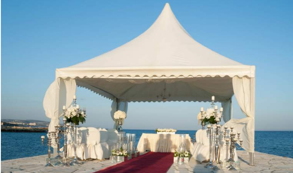
Wedding/Blessing Types: Civil, Beachside