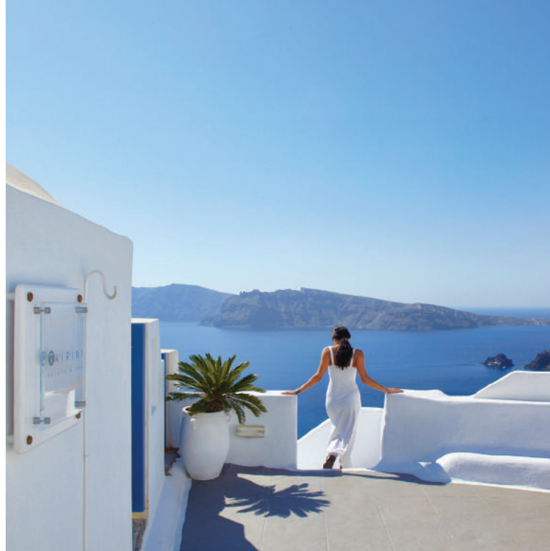
Wedding/Blessing Types: Civil