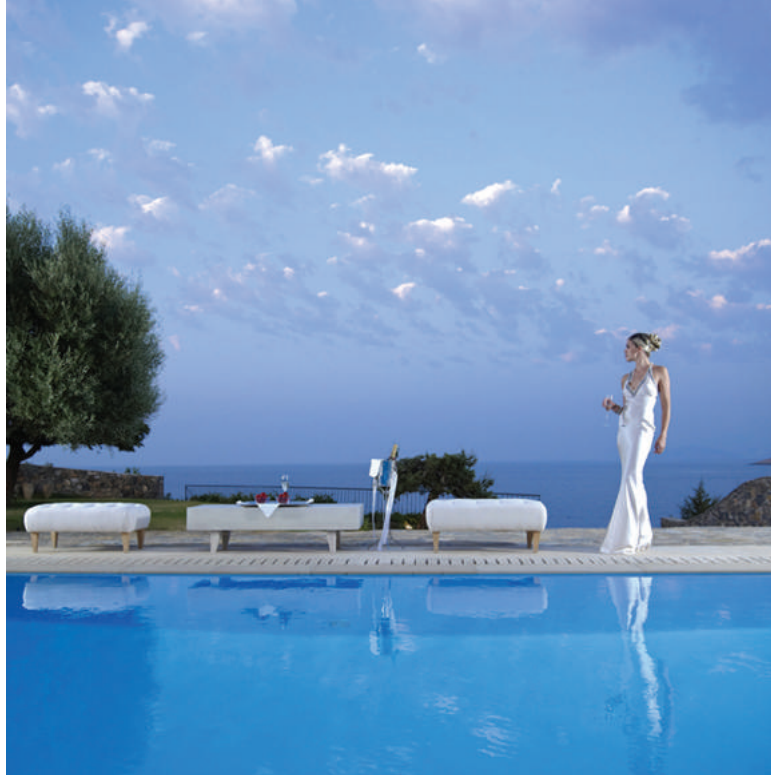
Wedding/Blessing Types: Civil, Beachside