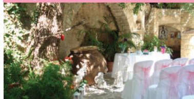
Ethnographical Museum - Paphos

With everything taken care of to the smallest detail, the museum leaves you no other choice but to relax and enjoy your big day with no stress. The exquisite outdoor garden area creates an exclusive venue and gives it an impressive touch, impossible to recreate.