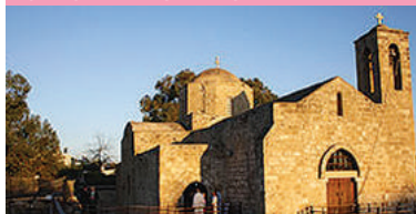
Ayia Kyriaki Chapel - Paphos

Situated in the centre of Paphos, this ancient church allows you to feel the true tradition Cyprus has to offer. Built in the early 13th century, the chapel offers its marriage services to both Anglican and Catholic wedding services with a backdrop of Roman ruins and magnificent mosaics.