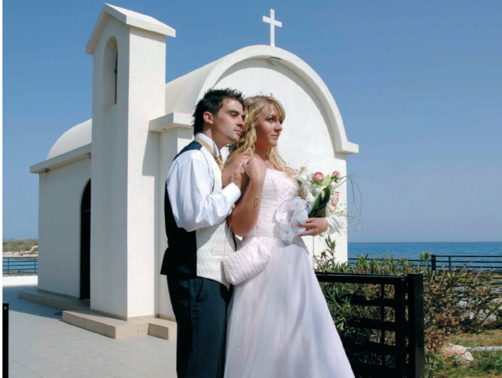
Wedding/Blessing Types: Civil, Beachside, Anglican, Catholic