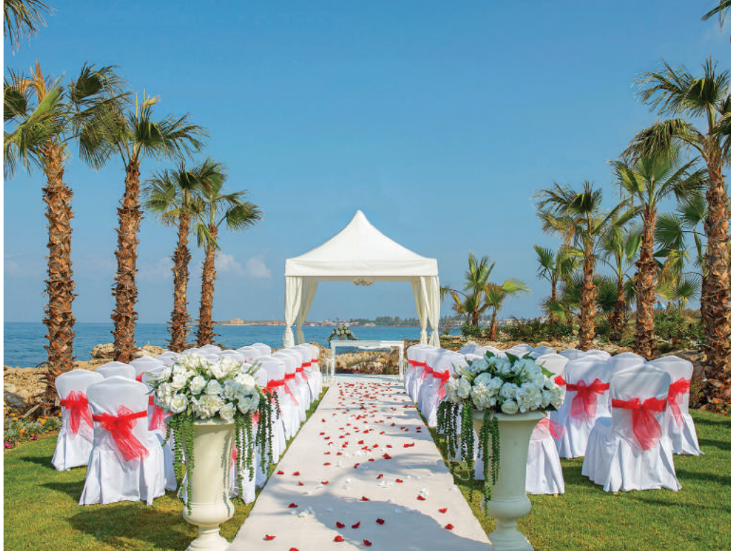
Wedding/Blessing Types: Civil, Beachside