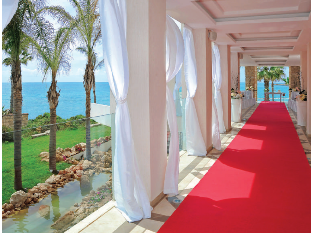
Wedding/Blessing Types: Civil, Beachside