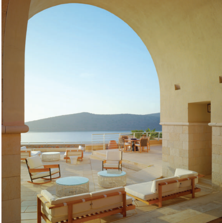
Wedding/Blessing Types: Civil, Beachside