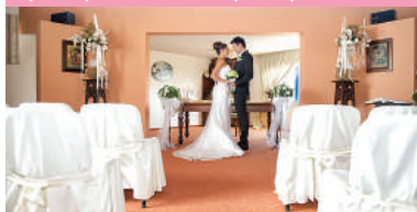
Ayia Napa Town Hall - Ayia Napa

The town hall of Ayia Napa is an indoor wedding venue providing civil ceremonies for couples. It's very modern and immaculate, allowing you to enjoy a relaxed day, holding up to 40 guests seated.