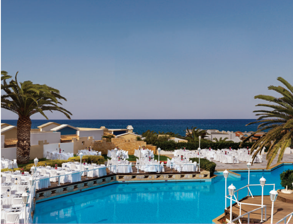
Wedding/Blessing Types: Civil, Beachside