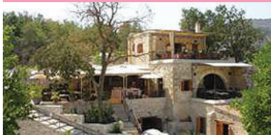
Kouyiouka Watermill - Paphos

Ageing back 2000 years, this venue can bring a touch of class and tradition to your wedding. The Kouyiouka Watermill allows you to educate your guests with the aged customs and traditions of Cyprus, letting them experience a different approach to weddings.