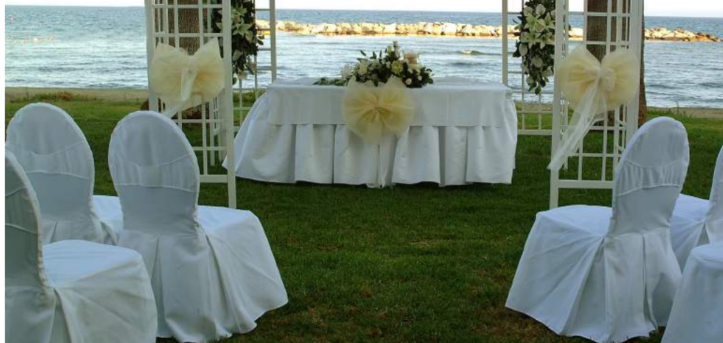
Wedding/Blessing Types: Civil, Beachside, Anglican, Catholic