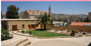
Yermasoyia Cultural Centre - Limassol

Located in the village of Yermasoyia, this beautifully renovated cultural centre, which can hold up to 40 guests is made with authentic stone walls and has an amphitheatre as a backdrop. Its stunning gardens create a natural but impressive look which makes it the perfect setting to have a memorable celebration.