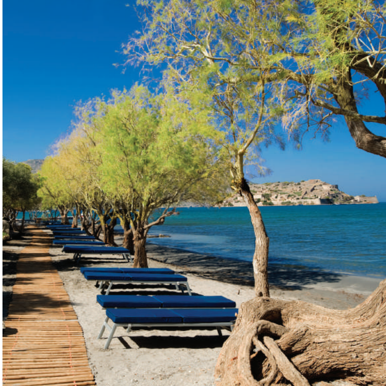
Wedding/Blessing Types: Civil, Beachside