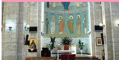
St Catherine's Catholic Church - Limassol

Located on the seafloor, this stunning church provides an exceptionally elegant backdrop to your wedding day as well as an 80sqm Byzantine painting behind the altar. This church holds up to 100 guests and has disabled access.