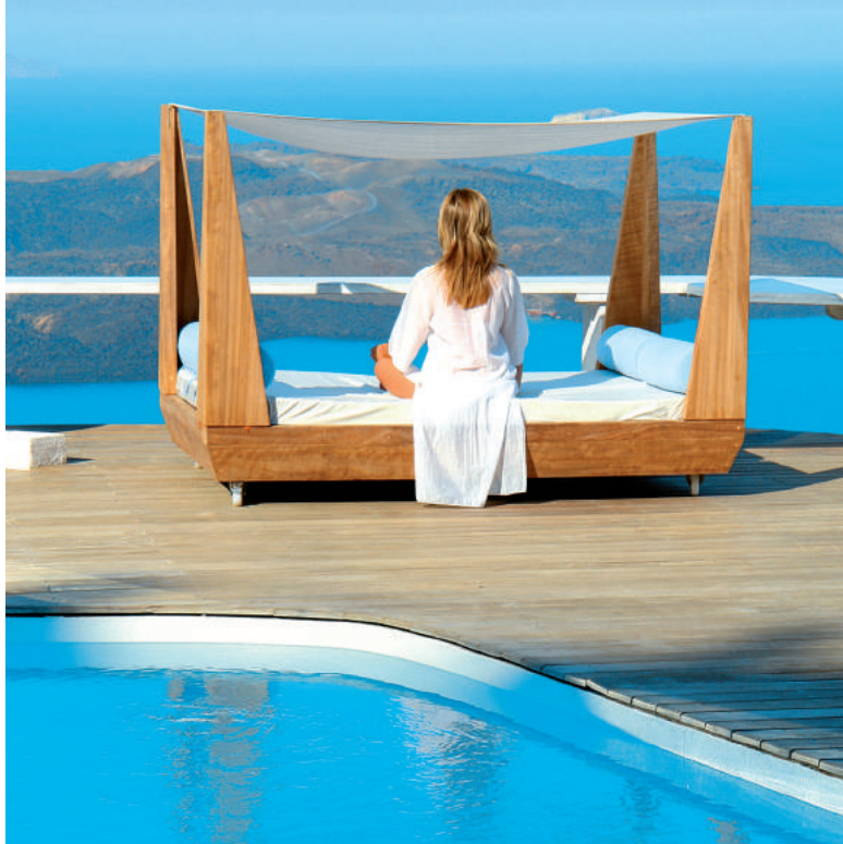
Wedding/Blessing Types: Civil