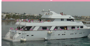
Exclusive Yacht Weddings

For a truly unique wedding experience, why not get married on board a luxury yacht? Catering for all tastes, a yacht wedding can be both unique and spectacular.