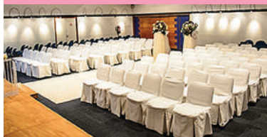
Paralimni Town Hall - Paralimni

The white covered walls, white carpet and white décor are sure to make the elegant flower arrangements stand out. This venue holds up to 100 people, the perfect number to be able to have your loved ones there to celebrate your special day.