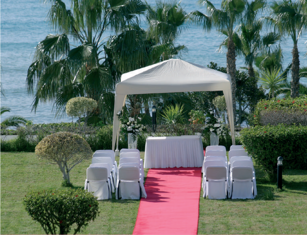
Wedding/Blessing Types: Civil, Beachside