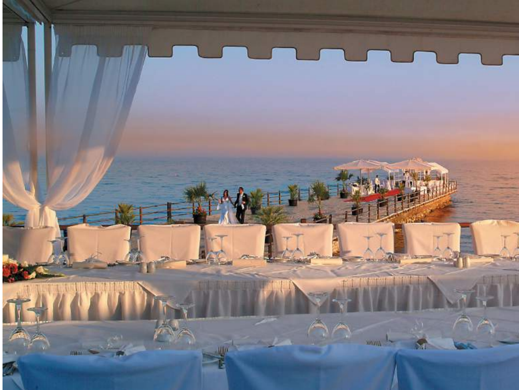
Wedding/Blessing Types: Civil, Beachside, Anglican, Catholic